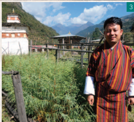
1. Measuring seedlings of Quercus brandegeei in Mexico. (The Morton Arboretum) 2. Seed collection in Uganda. (BGCI) 3. Cupressus cashmeriana , Dangchu Valley Committee, Bhutan. (BGCI) 4. Ya'axché rangers recording tree data in the Maya Mountain North Forest Reserve, Belize. (Ya'axché Conservation Trust)