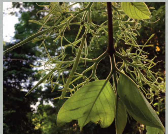
Vangueriopsis shimbaensis

In 2020, BGCI, the IUCN/SSC Conservation Planning Specialist Group (CPSG), and the Kenya Forest Service led a series of online workshops focused on planning conservation action for Kenya's threatened trees. These workshops used CPSG's "Assess to Plan" (A2P) methodology, which acts as an intermediate step to link single-species status assessment through to stakeholder-inclusive multi-species conservation action planning. The aim was to facilitate the rapid progression of threatened tree species from assessment, through conservation planning, into effective action in Kenya. The workshops provided an opportunity to bring together key stakeholders to discuss and evaluate the results of an A2P analysis for Kenya's more than 140 threatened tree species. This helped to identify priority sites for conservation of threatened tree species in Kenya and to group threatened species together that are likely to benefit from the same conservation activities. During these GTC workshops, a joint vision statement and goals were developed and priority actions were identified at national and regional levels to deliver conservation for Kenya's threatened trees.