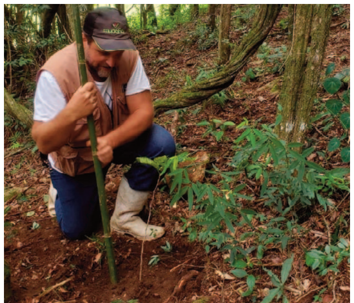
Planting seedlings of Paubrasilia echinata in Brazil.

As part of the GTC, Chauá conducted extensive field surveys, seed collection and germination trials from 2012-2020, which led to the inclusion of 215 native tree species in their nursery, 40 of which are threatened. Through outreach and training, they also aimed to catalyse a change in restoration practice in the region by mobilising nurseries and planting organisations to adopt threatened species within their ongoing operations. Over the length of the project, more than 50,000 seedlings from 40 threatened species were planted by 27 different stakeholders.