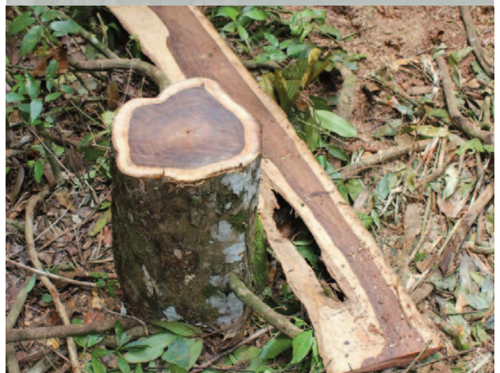
Dalbergia stevensonii in the Maya Golden Landscape, Belize. (Ya'axché Conservation Trust)

To support this work on the ground, Ya'axché also catalysed the Belizean government to place a national moratorium on Honduran rosewood logging in 2012 and played an active role in supporting the addition of the species to CITES (Convention on International Trade in Endangered Species of Wild Fauna and Flora) Appendix II in 2013. Ya'axché works closely with the government on overall conservation of Honduran rosewood, and has been able to further influence policy for the species, including the amendment of the Belize Forests Act and an update to the CITES Non-Detriment Finding (NDF). This combination of practical protection and conservation in the field supported by enabling national and international policy means this highly sought-after species has a far more secure future.