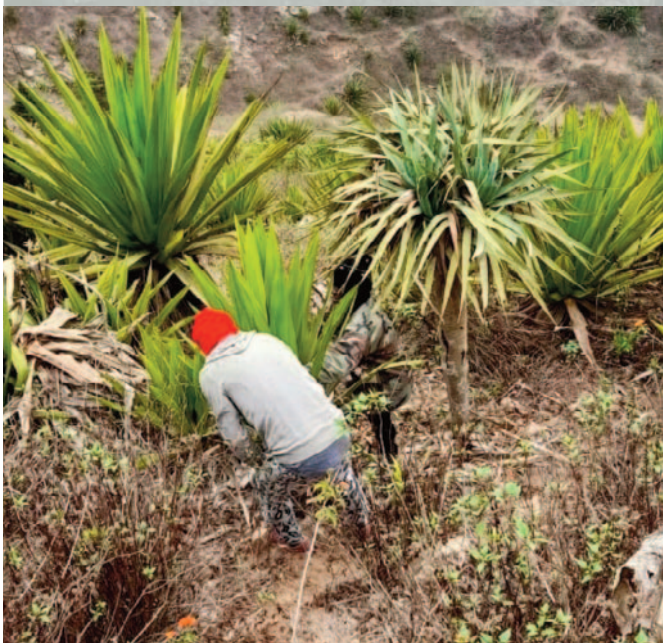
Above: Manual removal of invasive Furcraea foetida in Cape Verde. (Biflores). Below: Sustainable Protium attenuatum resin-tapping methods. (Jenny Daltry, FFI)

extinction, affected heavily by habitat loss and invasive plant species competing with and sometimes completely smothering them. Invasive plants including Prosopis juliflora , Furcraea foetida , Lantana camara and Ipomoea indica are known to directly impact around one third of the 400 individuals of the threatened endemic trees that remain on the island.