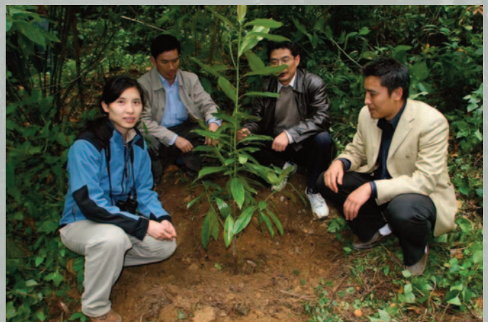
Magnolia sinica ( Xu Jian, FFI)