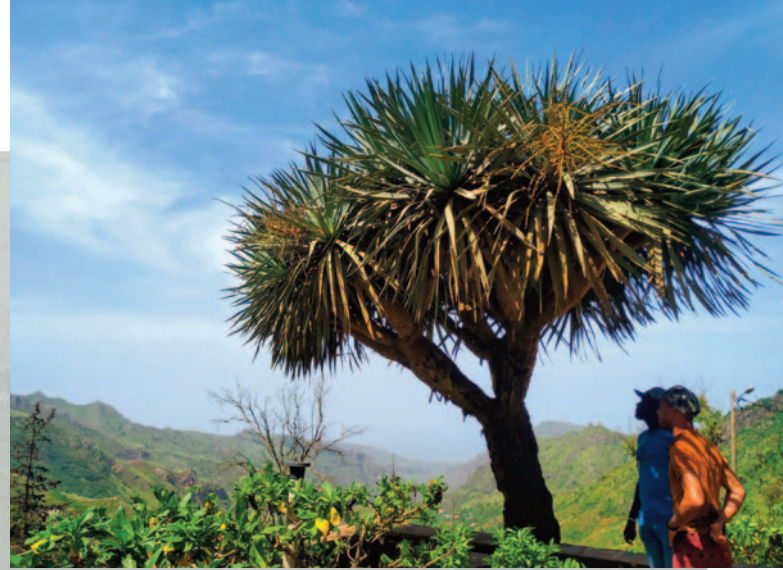
Dracaena draco subsp. caboverdeana (Biflores)

As part of the GTC, local NGO Biflores is working to physically remove the invasive plant species from around the threatened trees and to plant endemic trees in place of the removed invasives. The work has been planned in consultation with the Ministry of Environment and Agriculture and involves local stakeholders including farmers and landowners, whose support is vital to the success of these very practical interventions, including the prevention of re-invasion. Removal of invasives is accompanied by an outreach programme with local stakeholders and schools, to increase awareness of the three threatened tree species and the threats they are facing. Supported by FFI, Biflores is also working to develop a sustainable grazing management plan to combat the further threat to the trees and the wider environment from uncontrolled grazing livestock.