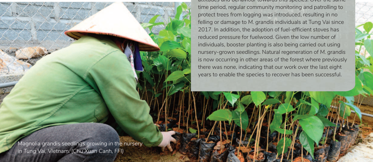
Magnolia grandis seedlings growing in the nursery in Tung Vai, Vietnam.

Since 2013, as part of the GTC, FFI has developed an outreach programme with local cardamom growers at Tung Vai Watershed Protection Area in Vietnam. These efforts are paying off, with local cardamom farmers now willingly maintaining M. grandis seedlings, indicating a shift in attitudes and behaviour towards this species. Over the same time period, regular community monitoring and patrolling to protect trees from logging was introduced, resulting in no felling or damage to M. grandis individuals at Tung Vai since 2017. In addition, the adoption of fuel-efficient stoves has reduced pressure for fuelwood. Given the low number of individuals, booster planting is also being carried out using nursery-grown seedlings. Natural regeneration of M. grandis is now occurring in other areas of the forest where previously there was none, indicating that our work over the last eight years to enable the species to recover has been successful.