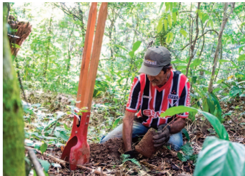
Planting seedlings of Paubrasilia echinata in Brazil. (Guaraci M. Diniz Jr., Jardim Botânico Araribá)

This current worldwide enthusiasm for restoration and tree planting can be harnessed to benefit threatened trees. Incorporating threatened trees in restoration programmes, or planting threatened species on farms, community land and other sites could contribute significantly to the recovery of threatened tree species, whilst also providing carbon capture and supporting livelihoods. The establishment or scaling up of associated supply chains for genetically representative seed and seedlings of threatened tree species will be required to achieve this.