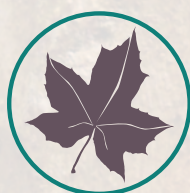
Global Conservation Consortium Acer

Target genera include those that are technically challenging to manage, including those that cannot be seed banked, as well as tree groups that are overlooked by other sectors and those that provide opportunities to build capacity for tree conservation in centres of diversity. Primary objectives of the GCC include coordinated in situ and ex situ conservation efforts and dissemination of species recovery knowledge. As of September 2021, GCC have been developed for six tree groups; Acer, Dipterocarps, Magnolia, Nothofagus, Oak, Rhododendron. These groups include more than 800 threatened species and the model is now also being applied to highly threatened non-tree groups.