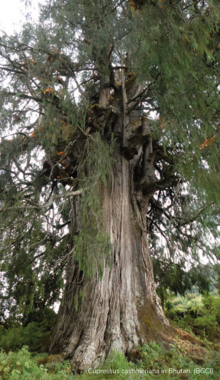
Cupressus cashmeriana in Bhutan.