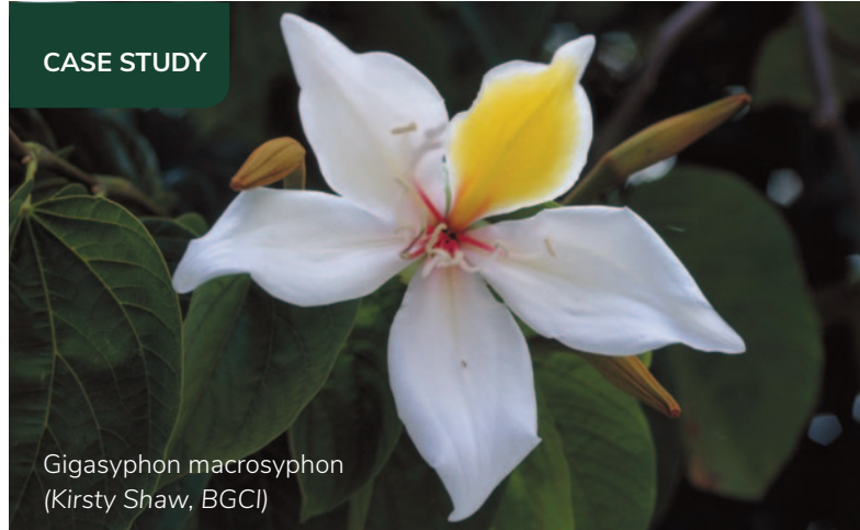
Gigasyphon macrosyphon (Kirsty Shaw, BGCI)