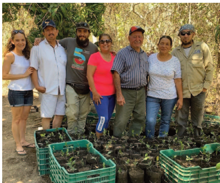
Quercus brandegeei team in Mexico.

The corporate sector has an expanded role to play, particularly timber, agriculture and extractives companies that are having a direct impact on tree species and their habitats, by reducing or