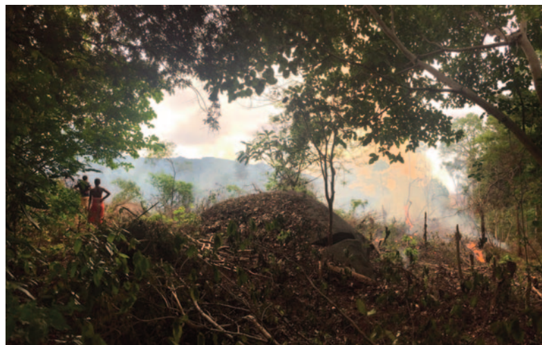
Land clearance in northern Madagascar.

The greatest threat to tree species is forest clearance and degradation, and the loss of other types of habitat. But the uniqueness of each of the nearly 60,000 different tree species means they often face their own individual challenges, from selective harvesting and overexploitation to pests and diseases to climate change. While the State of the World's Trees reports that over half of threatened tree species are recorded in at least one protected area, this does not necessarily guarantee their survival. Many threatened species require targeted, proactive management to ensure they can persist and thrive, fulfilling their unique ecological niche and contributing to the healthy, resilient ecosystems that are so vital to meet the overwhelming challenges that currently face our world.