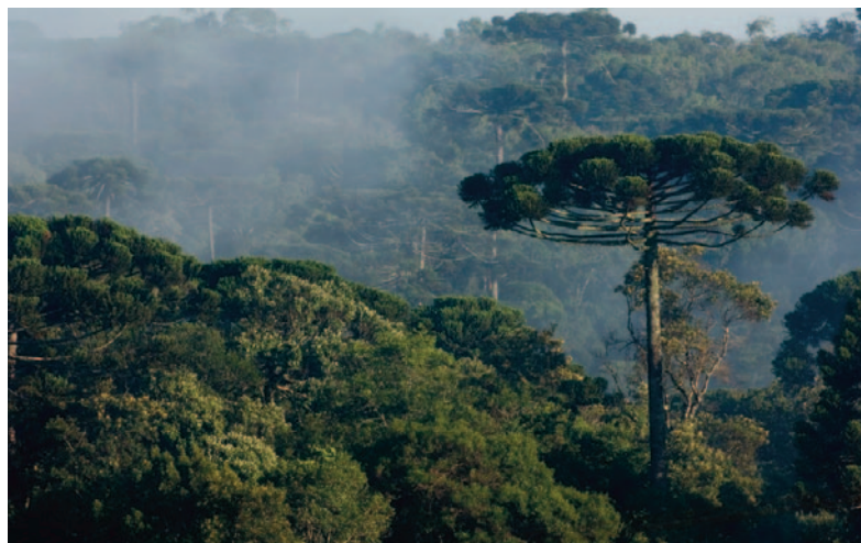
Araucaria angustifolia (Zig Koch)

Integrated conservation of tree species by botanic gardens: a reference manual https://globaltrees.org/wp-content/uploads/2013/11/tree_species_low.pdf