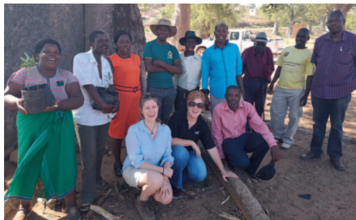
Warburgia salutaris conservation team in Zimbabwe.

mitigating their impact and taking an active role in the protection and restoration of threatened tree species.