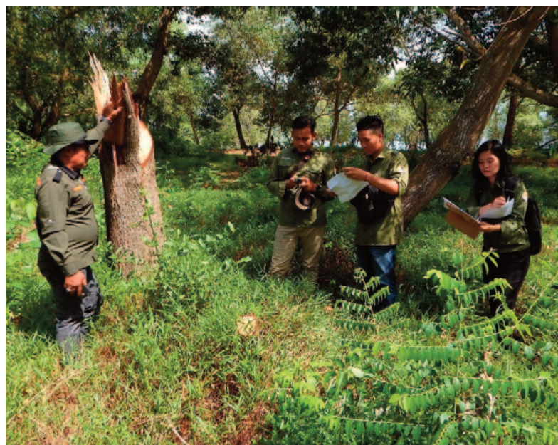
Training in threatened tree identification and patrol protocols in Indonesia.