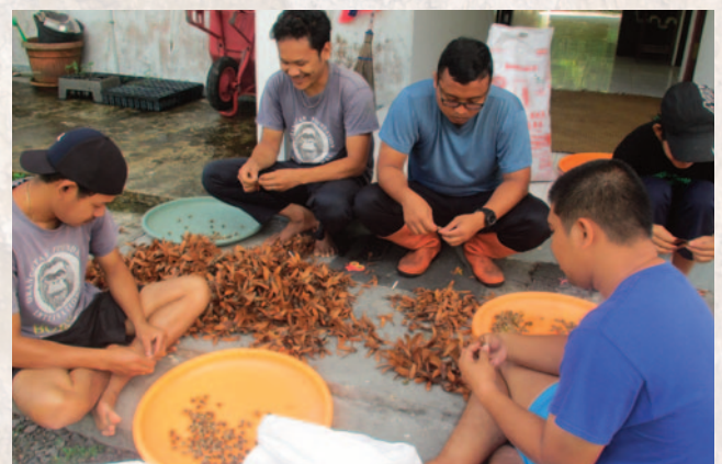
Processing seeds of Shorea leprosula in Indonesia.

Multiple options exist for the propagation of trees for planting. Seeds are always the preferred option, as each seed is genetically unique and thus helps to maintain a diverse pool of individuals within a population, improving resilience towards external pressures such as pests, diseases and changing future climatic conditions. Vegetative propagation methods such as taking cuttings or grafting can be used as a backup, for example for species with unpredictable or infrequent seed production, but this method is not preferable, as it results in individuals that are genetically identical to the parent tree. In the long term, this can leave the population vulnerable to external pressures as less resilience exists when genetic diversity is lower.