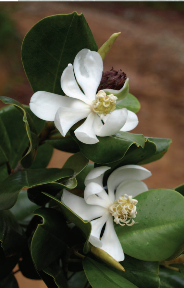
Magnolia pallescens (Scott Zona)

M. pallescens . Over the following years, priority recovery actions were scaled up for the species based on the recommendations of the plans. In 2020, a reinforcement planting event of M. pallescens took place in the Valle Nuevo National Park, La Siberia, Constanza, and was a highly effective public outreach initiative with the Minister of the Environment and staff in attendance. The government's involvement in the planning and action phase of this project is helping to promote planting of additional threatened tree species in the Dominican Republic.