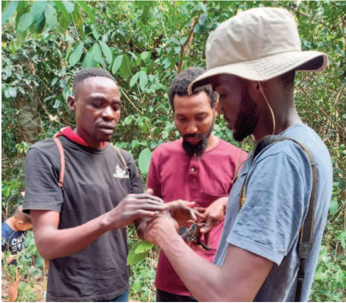
Seed collecting mission in the Shimba Hills, Kenya. (African Forest)