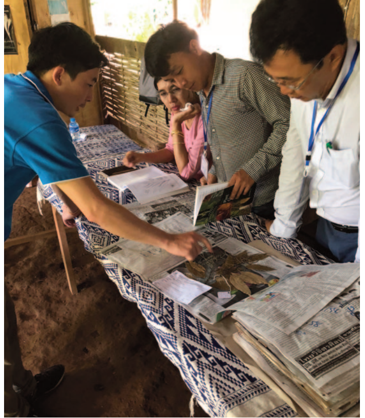
Above: Fagaceae training at Pha Tad Ke Botanic Garden in Laos. Left: Training in Yachang Nature Reserve, China.

Building partnerships facilitates the sharing of skills, knowledge and experience between people and organisations working to conserve threatened trees across regions and taxa. Long-term commitment to such partnerships can be key for impactful conservation, especially when a vital element of the collaboration is around capacity building or establishing enabling conditions necessary for sustainable conservation action. Investing in partnerships over many years can help to ensure that increased capacity is retained and passed on to others within collaborating organisations, rather than staying limited to a few individuals who may move on.