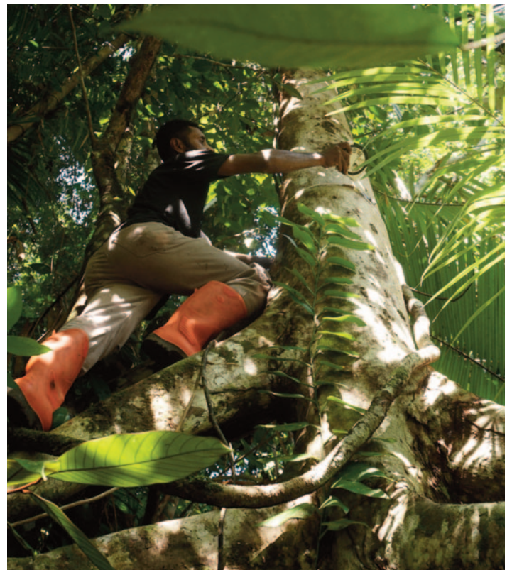
Tree diameter measurement of Canarium sp., Raja Ampat, Indonesia. (Yanuar Ishaq Dc, FFI)

The Conservation Tracker, accessed via the species pages on the GlobalTree Portal, provides real-time information on who is taking conservation action for which species, to identify gaps and further prioritise where additional efforts are required.