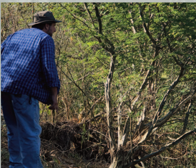
Monitoring growth of planted Chloroleucon leucum seedlings, Jardim Botânico Arariba Brazil.