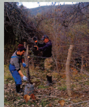
Left: Malus niedzwetzkyana. Right: Fencing Pyrus korshinskyi trees in Kyrgyzstan.