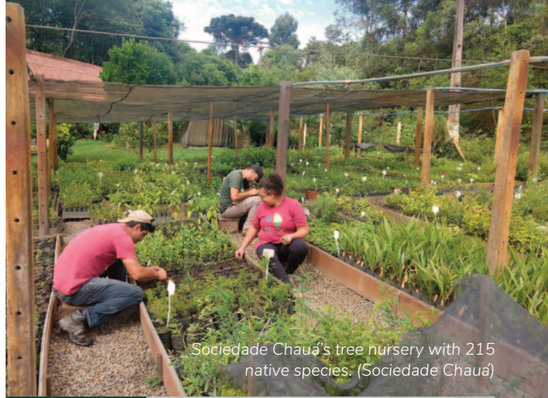
Sociedade Chauá's tree nursery with 215 native species.