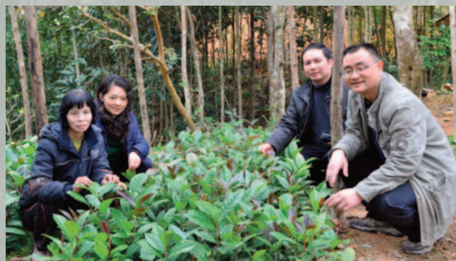
Propagation of golden camellia seedlings.

As part of the GTC, in collaboration with FGCNNR, Guangxi Institute of Botany, local golden camellia companies, local communities and BGCI, a stock of approximately 20,000 plants was cultivated to establish a 12-hectare restoration and demonstration plot to increase public awareness of the status of these species and the need for further species and habitat recovery work. Three hundred and sixty five households received training on propagation techniques and are now engaged in golden camellia propagation and cultivation to take pressure off natural and restored populations. Local people are working jointly with local companies that process flowers and leaves into various products, including highly priced golden camellia teas. These partnerships have proved to be very successful and have provided an alternative, sustainable source of income for participating households.