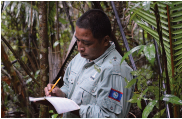
Ya'axché ranger in Maya Golden Landscape, Belize.