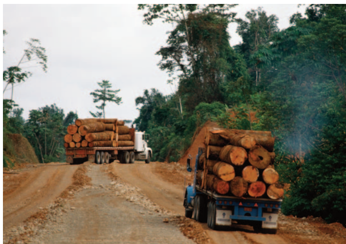
Logging in the Choco rainforest, Ecuador.

Individual tree species play numerous economic, ecological and cultural roles. We depend on trees in our everyday lives - they provide us with food, timber and medicine. According to the State of the World's Trees , one in five tree species is recorded as having a specified human use and many have a variety of different uses. But it's not only people that depend on trees. As primary producers at the base of the food chain, plants, including trees, are the building blocks of ecosystems, essential to all life on this planet. A myriad of species of plants, animals and fungi are intrinsically linked to trees, often interacting within complex and fascinating mutually beneficial relationships that both parties depend on for survival.