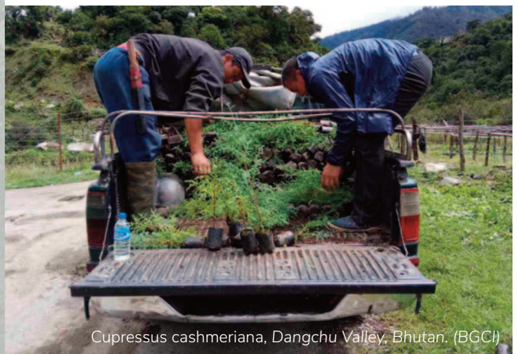
Cupressus cashmeriana , Dangchu Valley, Bhutan.

The national tree of Bhutan, Near Threatened Cupressus cashmeriana , known as tsenden, is of immense cultural and religious significance to the people of Bhutan for the construction of holy buildings (Dzongs) and monasteries. The demand for this tree has put wild populations at risk of overexploitation. The Mayor of Dangchu Valley, where the largest population of this species occurs, requested technical assistance from GTC to identify mother trees and establish a restoration programme. Following training and mentorship provided by GTC and our partners, the people of Dangchu Valley have formed a community nursery that is cultivating, conserving and planting tsenden for future generations. With the assistance of the GTC, the Royal Botanic Garden Serbithang and the Royal Botanic Garden Edinburgh, the people of Dangchu village have planted over 12 hectares with around 41,000 tsenden seedlings propagated from seed collected from genetically diverse local trees.