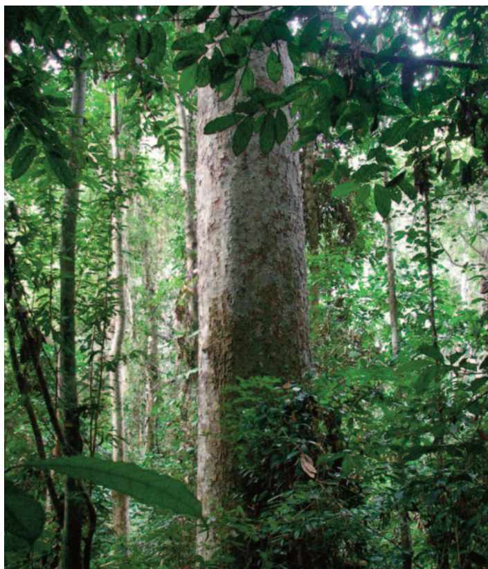
Copaifera religiosa