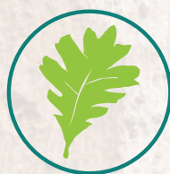
Global Conservation Consortium Oak