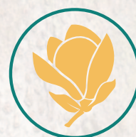
Global Conservation Consortium Magnolia