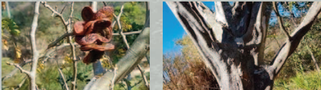
Chloroleucon tortum (Noelia Alvarez de Román, BGCI)

JBA integrates threatened tree species into restoration, including Endangered Paubrasilia echinata , Vulnerable Cedrela fissilis , Critically Endangered Chloroleucon tortum , and Vulnerable Zeyheria tuberculosa . The plants for the restoration project are grown in partnership with a commercial nursery "Ambiental mudas" that is also supplying these native tree seedlings to customers for planting in their local area. As a result, the species are becoming part of the local supply chain of native tree species in Sao Paulo.