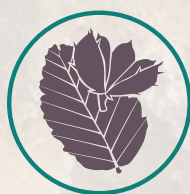
Global Conservation Consortium Nothofagus