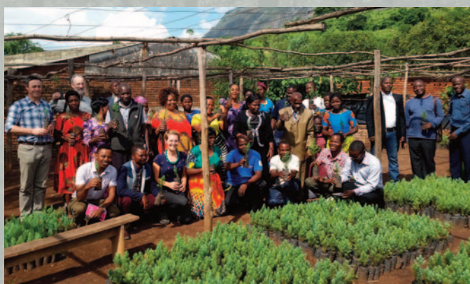
Widdringtonia whytei seedlings in Malawi.

As part of the GTC, a project led by Mulanje Mountain Conservation Trust, the Forestry Research Institute of Malawi and BGCI, set up eight community nurseries around Mount