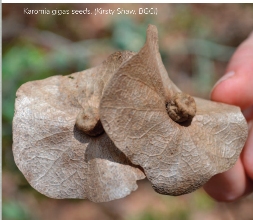
Karomia gigas seeds.

CR The last known tree of Karomia gigas in Kenya was felled in the 1970s. The first recording of this species in Tanzania was in 1993, when a collection of a single seed was made but it was not possible to locate the source. In both countries, coastal forest has been largely cleared for agriculture, and residential and tourism development. Logging is also likely a threat to this tree. The species was assessed as Critically Endangered and flagged as Possibly Extinct in the 1998 IUCN Red List Assessment. However, it was rediscovered in 2011 and subsequent survey work led by GTC partners, the Tanzania Forest Service and the University of Dar es Salaam Herbarium has increased the population count to 40 individuals (21 mature individuals) at two sites in Southern Tanzania. The species remains assessed as Critically Endangered due to its small population. Survey work has provided accurate baseline information for the species to plan appropriate conservation actions and seed has been collected to initiate a recovery programme. In 2021, young trees of this species growing ex situ at Missouri Botanical Garden in the U.S.A. produced flowers - the first time flowers of this species have been documented.