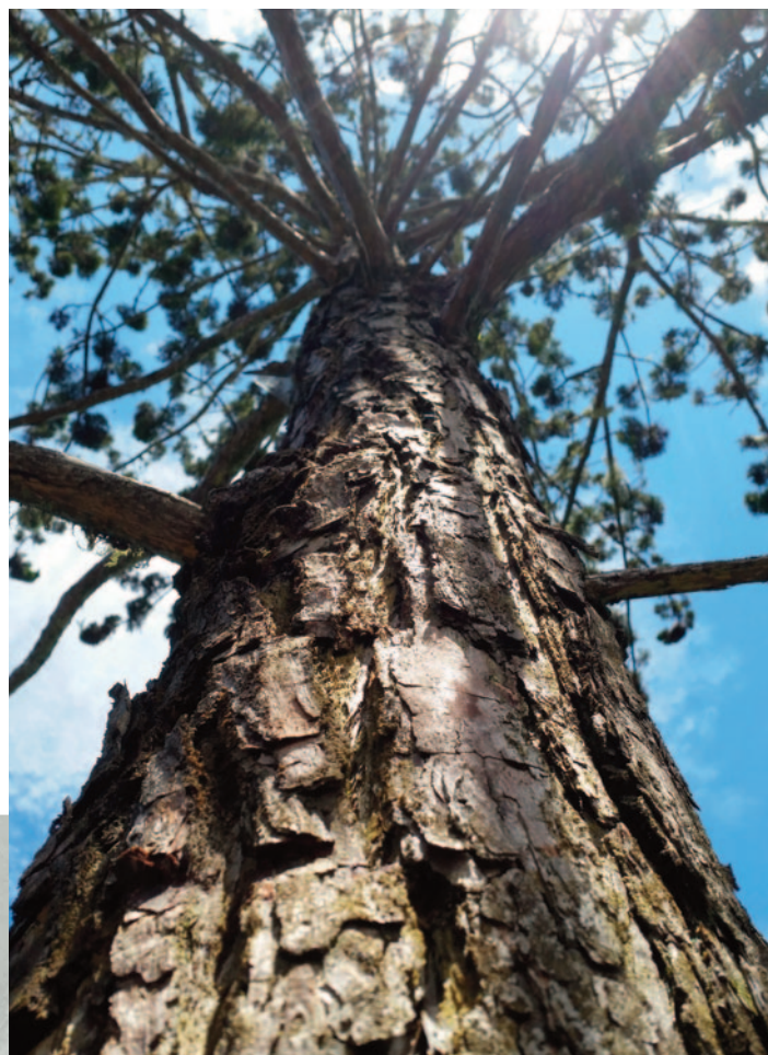
Widdringtonia whytei

Whatever approach is taken to reduce threats, improve natural regeneration or restore populations of the tree species, the full engagement and participation of local stakeholders is key to the success of all tree conservation initiatives. This ensures that the approach is appropriate to the local context, has local ownership and support and is more likely to achieve lasting impact.